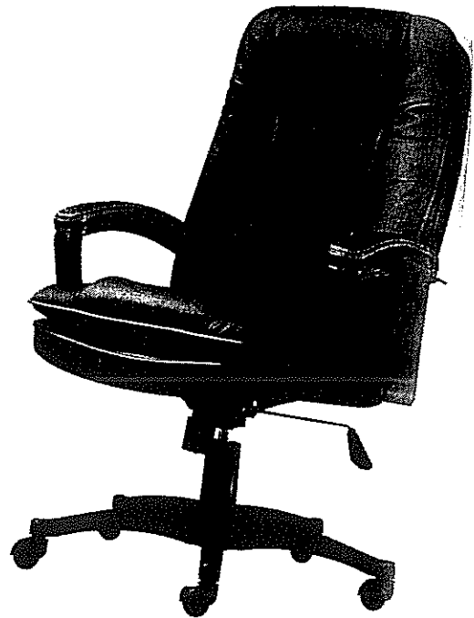
Loreen Highback Leather Touch

Big Guys Heavy Duty Range Material: Pleather. Swivel & tilt. Aluminium colour base and arms. Available ex-stock | 1 MD - High Back Chair, 560mm Seat width. 520mm Seat depth. 600mm Back width. 800mm Back height | 2 CEO - High Back Chair, 550mm Seat width. 520mm Seat depth. 520mm Back width. 700mm Back height. Imported. 150kg Max Weight. 2 Year Guarantee.